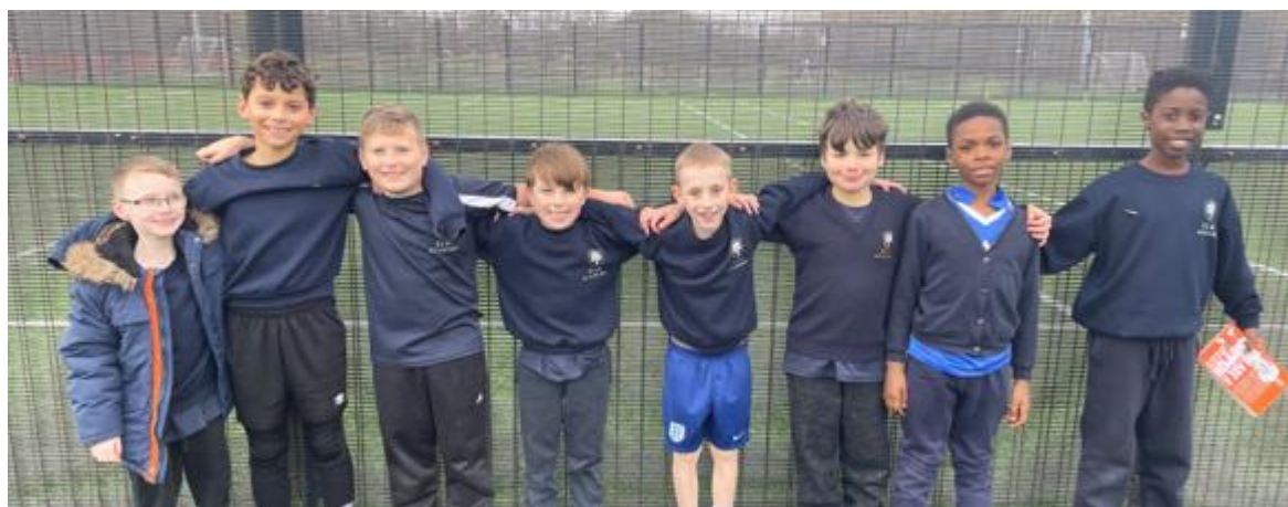
Well done team – Can do Football