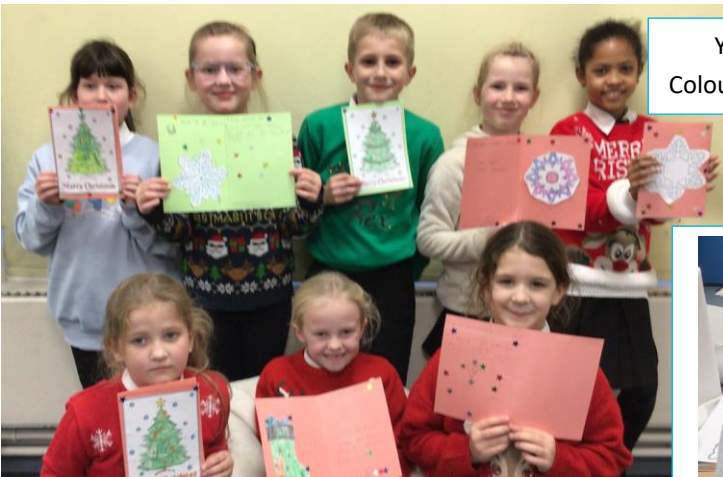
Year 3 Colouring Club