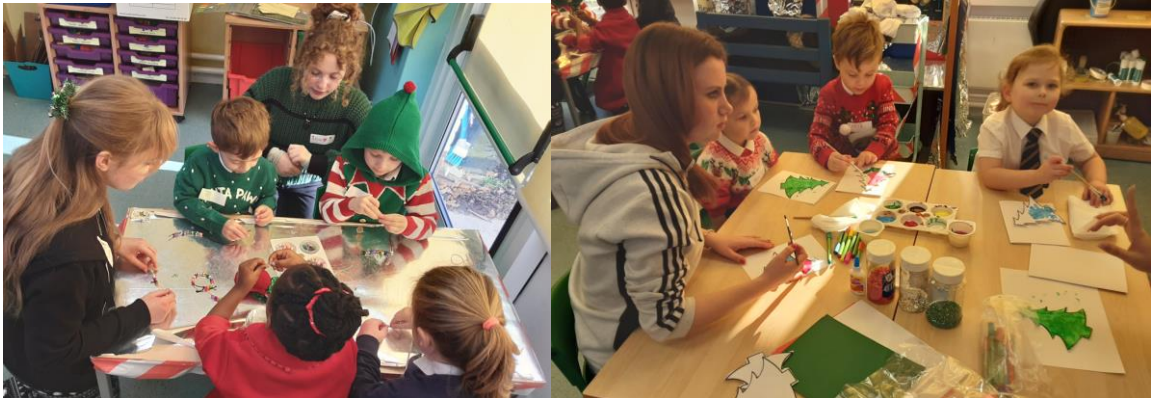
Reception enjoy some fun activities setup from local students from Oak Academy