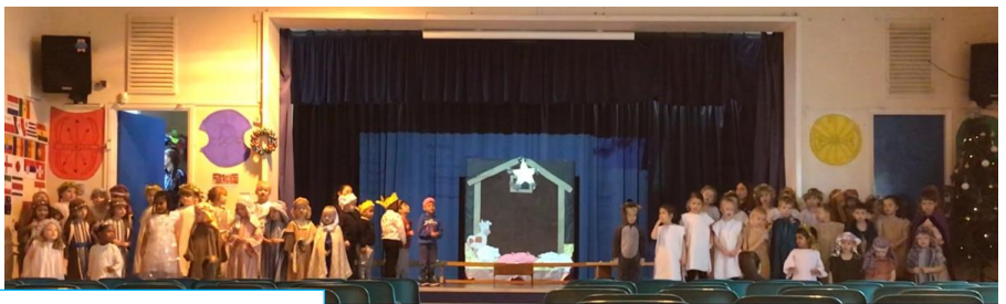
Reception & Nursery