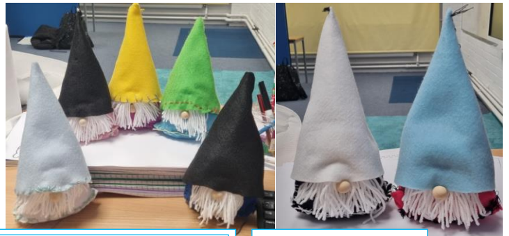
Gonk Madness in Sewing Club